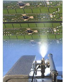
“a 50% overlap will give the most uniform spray pattern...”

shorts and icicles are observed. From this point increase the flux level again until defects disappear.