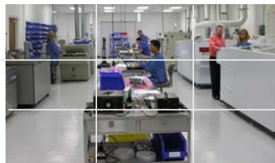
Testing performed in Kyzen's fully staffed and equipped applications laboratory located in Nashville, TN.

Application recommendations are intended to serve as only a guideline. To request a free-of-charge cleaning trial, expert cleaning process optimization or additional cleaning material information, please contact Kyzen Corporation.