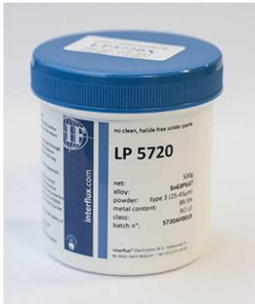
Products pictured may differ from the product delivered

The solder paste is classified as RO L0 according IPC and EN standards.